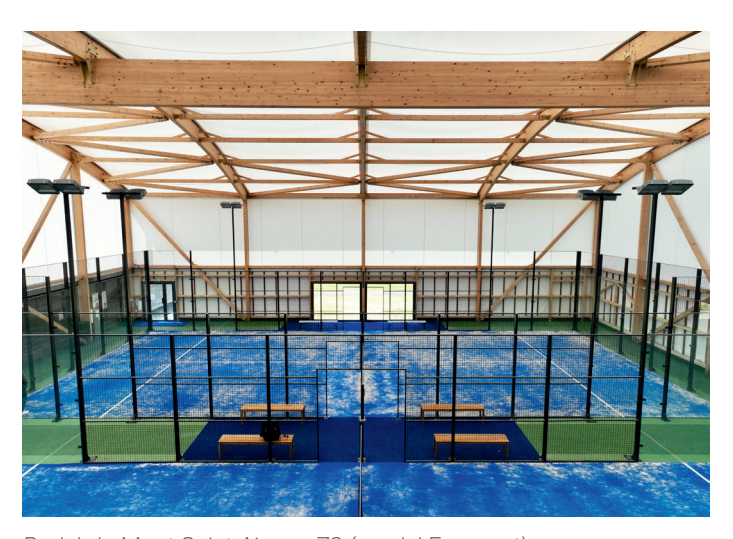
Padel de Mont Saint Aignan 76 (model Ecosport)