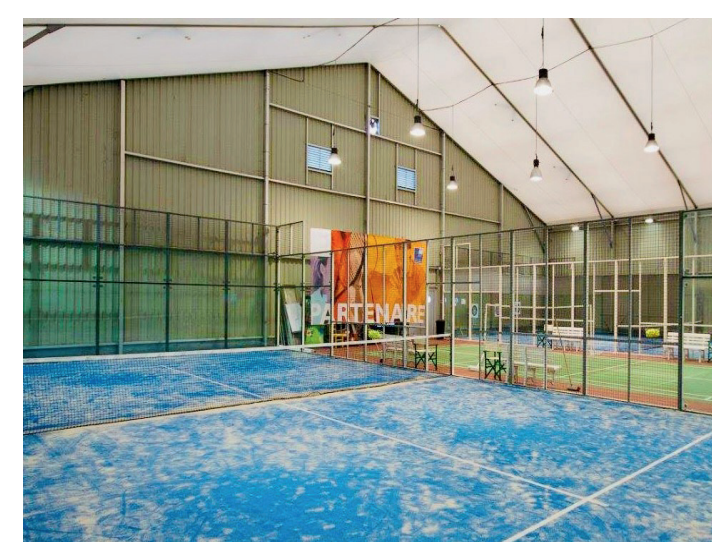
Padel club de L'Hers 31 (model Prosport)

Whether you are creating a new complex or covering existing Padel courts with a Losberger De Boer building, our solution ensures year-round playability. We define the "building" by covering the roof and facades, guaranteeing complete waterproofing, protection from adverse weather conditions within your gaming area, and athlete comfort.